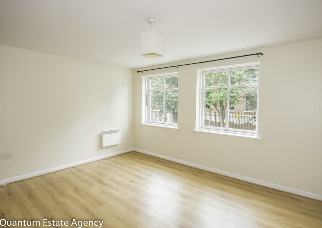
Quantum Estate Agency