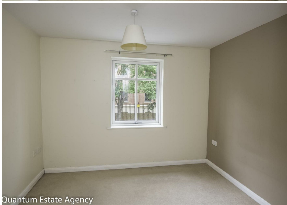
Quantum Estate Agency