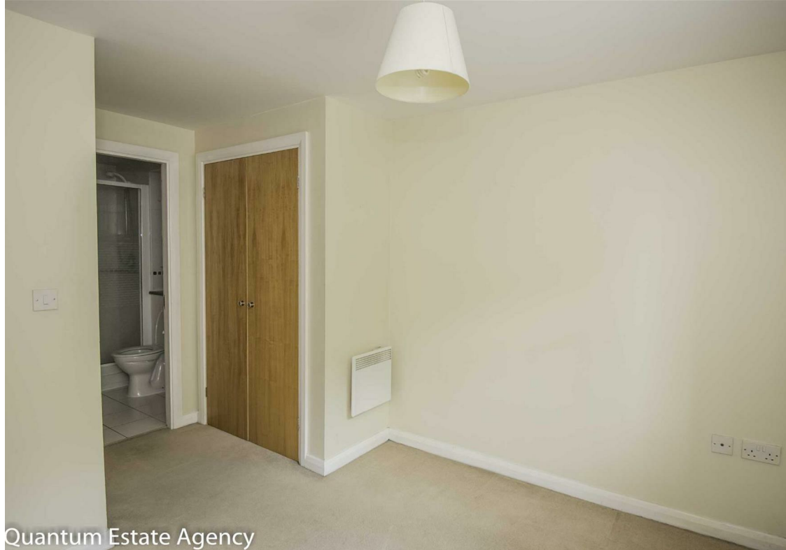
Quantum Estate Agency