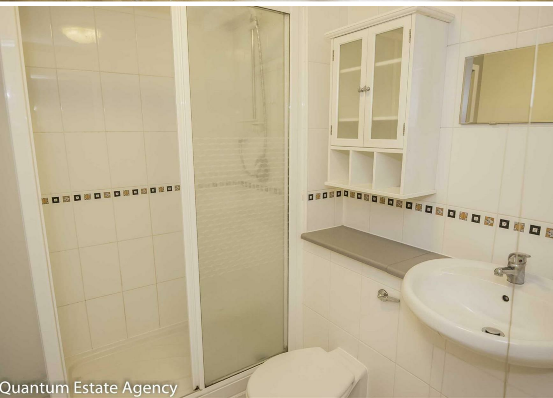
Quantum Estate Agency